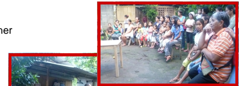
One of the weekly bible studies