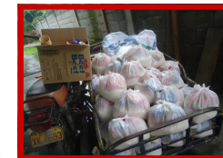
Mode of transportation in delivering the hot meal, groceries and school supplies

It is our prayer that we can give at least $200.00 per month to their budget as well as help to finance the purchase of a multi cab (small covered minivan) that will transport the groceries, hot meal and volunteers to the far reaches of their