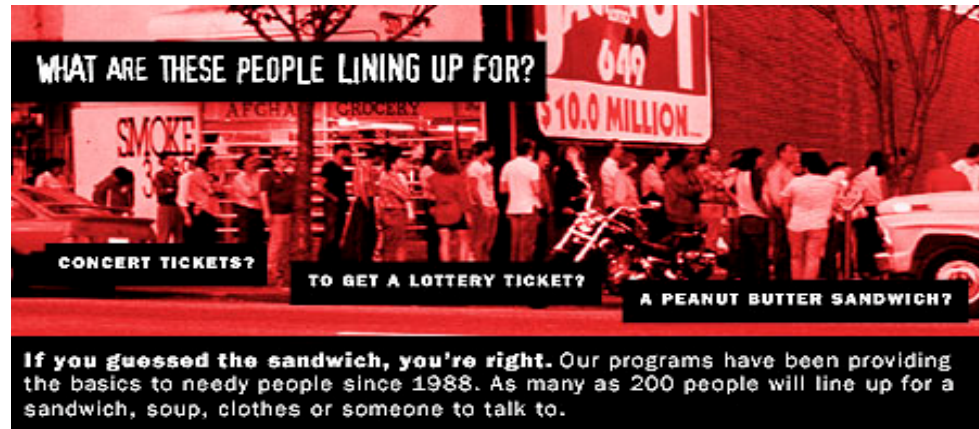
If you guessed the sandwich, you're right. Our programs have been providing the basics to needy people since 1988. As many as 200 people will line up for a sandwich, soup, clothes or someone to talk to.

Our Mission “To be a bridge between those that have, and those that have not”