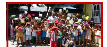
Some of the children that received precious school supplies

region which can be miles away. The cost of a good used multi cab vehicle can be around $4000.00 Canadian. This is an impossible task on their own but with friends from Canada, we together could make a huge difference in hundreds of lives. Please pray and ask God what amount of contribution you could give to this cause to join us in reaching out over seas with Christ's love and provisions.