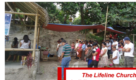
The Lifeline Church building and congregation of 40 adults plus numerous more children