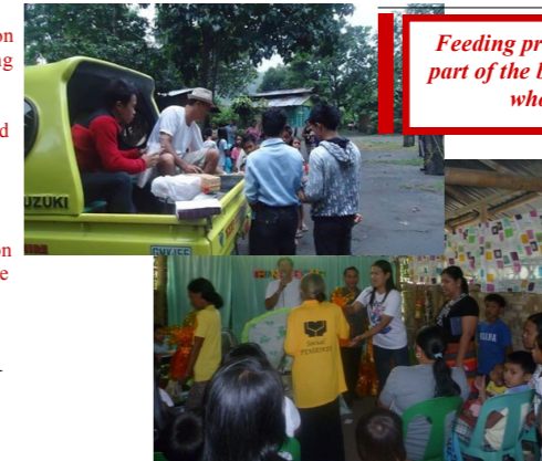
Feeding program is a large part of the blessings to those who gather.

"Then the King will say to those on His right, come, you who are blessed by My Father; Take your inheritance, the kingdom prepared for you since the creation of the world. For I was hungry you gave me something to eat, I was thirsty and you gave me something to drink, I was a stranger and you invited me, I needed clothes and you clothed me, I was sick and you looked after me, I was in prison and you came to visit me. Then the righteous will answer Him, Lord when did we see You hungry and feed You or thirsty and give You something to drink? When did we see You a stranger and invite You in, or see You sick or in prison and go to visit You? The King will reply, I tell you the truth, whatever you did for one of the least of these brothers of Mine, you did it for Me" Matthew 25:34-40