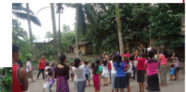
Children's Ministry to over 50 beautiful recipients

The Gospel is now shared in schools, in our Good News class every Saturday and Young Peoples Program every Sunday afternoon.